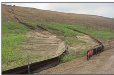
Figure 23. New silt fence below the old fence

(ASTM 2003) recommends removing sediment deposits from behind the fence when they reach half the height of the fence or installing a second fence. However, there are several problems associated with cleaning out silt fences. Once the fabric is clogged with sediment, it can no longer drain slowly and function as originally designed. The result is normally a low volume sediment basin because the cleaning process doesn't unclog the fabric. The soil is normally very wet behind a silt fence, inhibiting the use of equipment needed to move it. A back hoe is commonly used, but, if the sediment is removed, what is to be done with it during construction? Another solution is to leave the sediment in place where it is stable and build a new silt fence above or below it to collect additional sediment as shown in Figure 23. The proper maintenance may be site specific, e.g. small construction sites might not have sufficient space for another silt fence. Adequate access to the sediment control devices should be provided so inspections and maintenance can be performed.