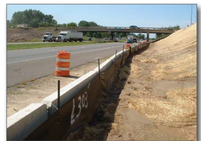
Figure 20. Silt fence protecting a highway and underground fiber optics cable

Highway example. Because of the proximity of a construction site to a highway, a concrete barrier was required by Minnesota's DOT to protect the highway and an underground fiber optic cable next to the highway from construction activities. The concrete barrier was used to support a silt fence along the perimeter of a large amount of dirt that was stock piled before being used for fill at a different location.