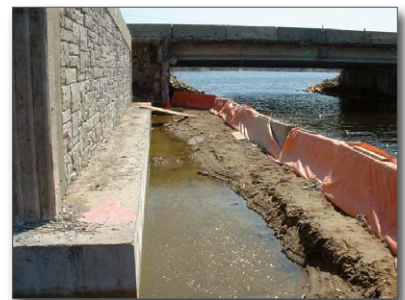
Figure 19. Silt fence for bridge abutment excavation

Bridge abutment example. During the construction of a bridge over a river between two lakes, an excavation on the river bank was needed to pour footings for the bridge abutment. The silt fence along the excavation's perimeter, composed of concrete highway barriers with orange filter fabric, was designed to prevent stormwater from washing excavated spoil into the river and to fend off the river during high flows. A portion of the orange filter fabric that has blown away from the concrete barriers shows the need to overlap and reinforce the joints where two sections of filter fabric are attached.