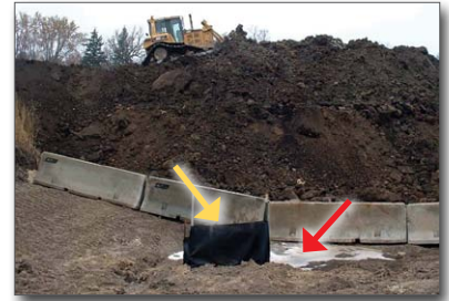
Figure 18. Front of silt fence on part of stock pile's perimeter

damage a conventional silt fence. The bottom of the porous fabric is held firmly against both the ground and base of precast concrete, highway, barriers by light-colored stones. An alternative installation would be having the concrete barriers rest directly on the bottom edge of the filter fabric, which would extend under the barriers about 10", so the barriers' weight will press the fabric against the ground to prevent washout. Water passing through the silt fence (red arrow in Figure 18) flows to a storm sewer culvert inlet, which is surrounded by a fabric silt fence (yellow arrows in Figures 17 and 18) that reduces the runoff's velocity and allows settling before the water is discharged to a creek.