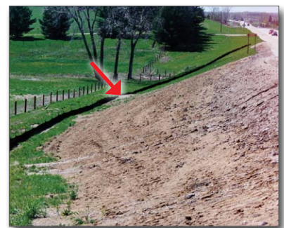
Figure 4. Avoid long runs of silt fence