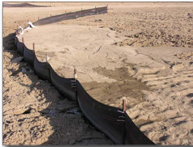
Figure 1. Silt fence retaining sediment

The purpose of a silt fence is to retain the soil on disturbed land (Figure 1), such as a construction site, until the activities disturbing the land are sufficiently completed to allow revegetation and permanent soil stabilization to begin. Keeping the