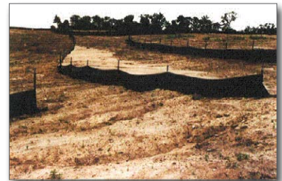
Figure 2. Create manageable sediment storage areas

Segment the site into manageable sediment storage areas for using multiple silt fence runs. The drainage area above any fence should usually not exceed a quarter of an acre. Water flowing over the top of a fence during a normal rainfall indicates the drainage area is too large. An equation for calculating the maximum drainage area length above a silt fence, measured perpendicular to the fence, is given in Fifield, 2011. Avoid long runs of silt fence because they concentrate the water in a small area where it will easily overflow the fence. The lowest point of the fence in Figure 4 is indicated by a red arrow. Water is directed to this low point by both long runs of fence on either side of the arrow. Most of the water overflows the fence at this low point and little sediment is trapped for such a long fence.