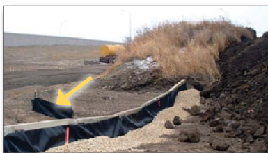
Figure 17. Back of silt fence on part of the stock pile's perimeter

A stock pile of dirt and large rocks is shown in Figures 17 and 18 with a silt fence protecting a portion of its perimeter. Rocks that roll down the pile would likely