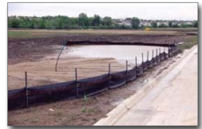
Figure 10. Gentle slopes may require a silt fence

of a gentle slope, if large (Figure 10), can be more important than its slope in determining sediment loss. A silt fence should not be placed in a channel with continuous flow (channels in Figures 8 and 9 don't have a continuous flow), nor across a narrow or steep-sided channel. But when necessary a silt fence can be placed parallel to the channel to retain sediment before it enters the watercourse.