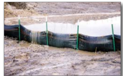
Figure 3. Water should not flow over the filter fabric during a normal rainfall