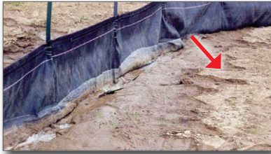
Figure 16. Poor compaction has resulted in infiltration and water flowing under this silt fence causing retained sediment washout

can't turn without making a wider excavation, and this results in poorer soil compaction, which allows infiltration along the underground portion of the fence. This infiltration leads to water seeking pathways under the fence, which causes subsequent soil