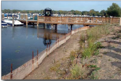
Figure 21. Silt fence protecting a lake shore